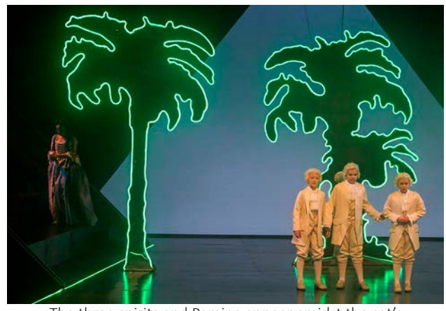
The three spirits and Pamina appear amidst the set's illuminated fiber-optic outlined mirrored palms.

One recent controversial Ring setting turned out quite well. The magic of the Cirque de Soleil was applied by Robert LePage to the Met's last Ring with a series of giant planks on a huge drum that lent itself to every part of the cycle. Rhine maidens managed to be trapeze artists as well as vocalists in a high-tech combining of projections, lighting and other special effects